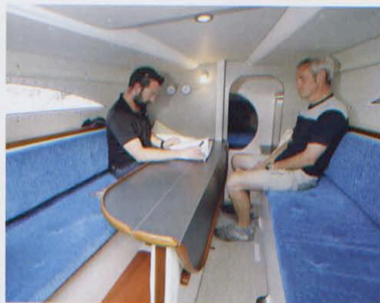
The coastal cruising saloon dines six but lacks ventilation. With the grey sole panel folded up, it's easy to walk forward