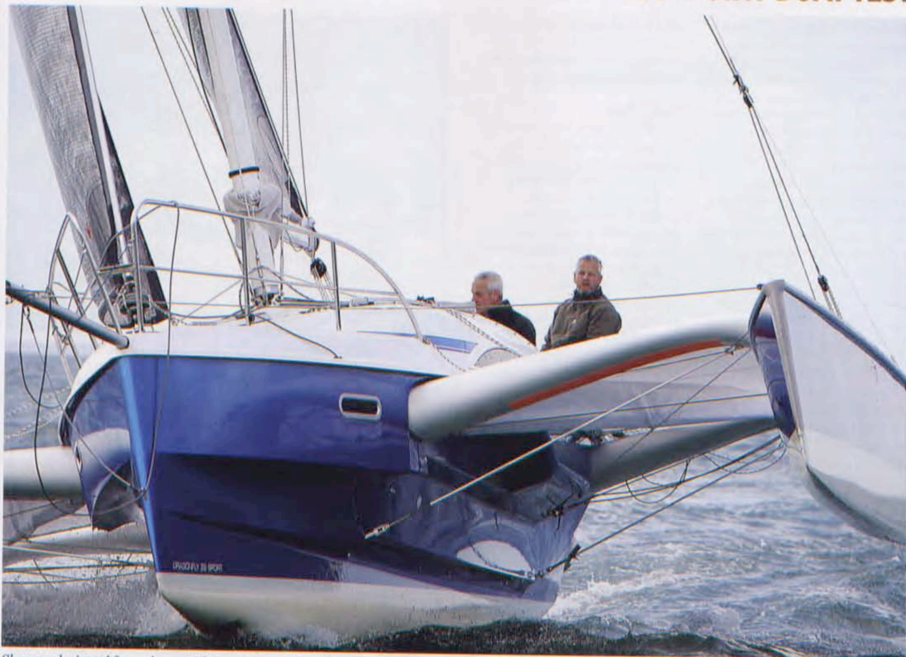
She was designed from the outside in, so the topsides have recesses to accommodate the stowed outriggers. The sprayrails also improve space below

good monohull's angle of around 30° to the wind, and tack through 90° – very respectable. In 20–22 knots of apparent wind, though, I can't think of any 28ft monohulls that can make 10.2 knots upwind.