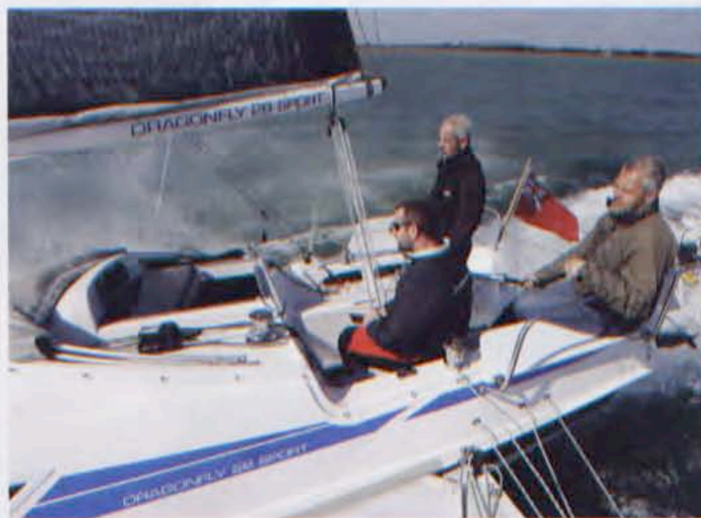
Despite the spray, the high cockpit is dry – even without the sprayhood

Offwind sails are flown from a bowsprit that folds back horizontally and has a fixed bobstay. The 920's bowsprit had a vertical hinge and a purchase system on the bobstay, but this wasn't thought to be up to the loads associated with modern offwind sails such as a Code Zero,