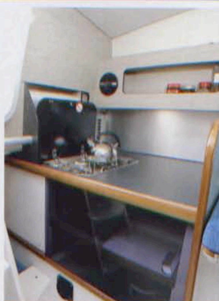
No frills but fully functional with sink opposite and plenty of stowage