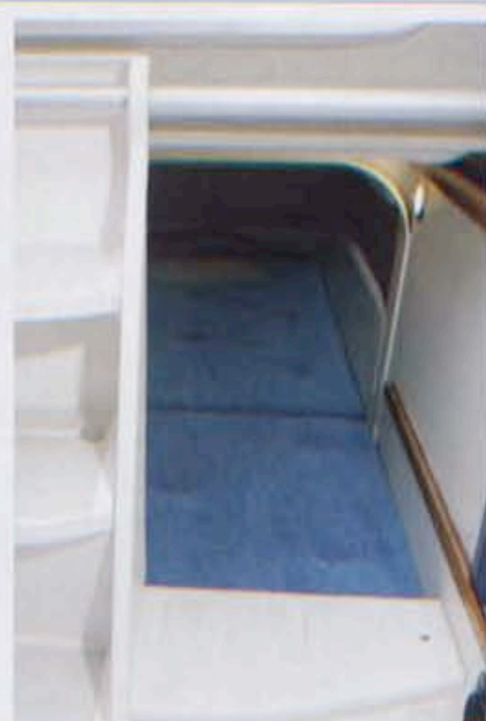
There's a perfect 'den' berth for the kids below the cockpit