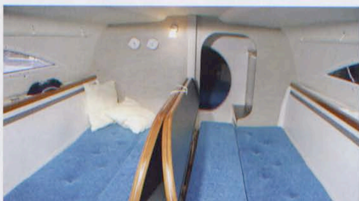
A clever rearrangement of the saloon leaves you with two good single seaberths, but they do restrict others moving fore and aft, so not ideal