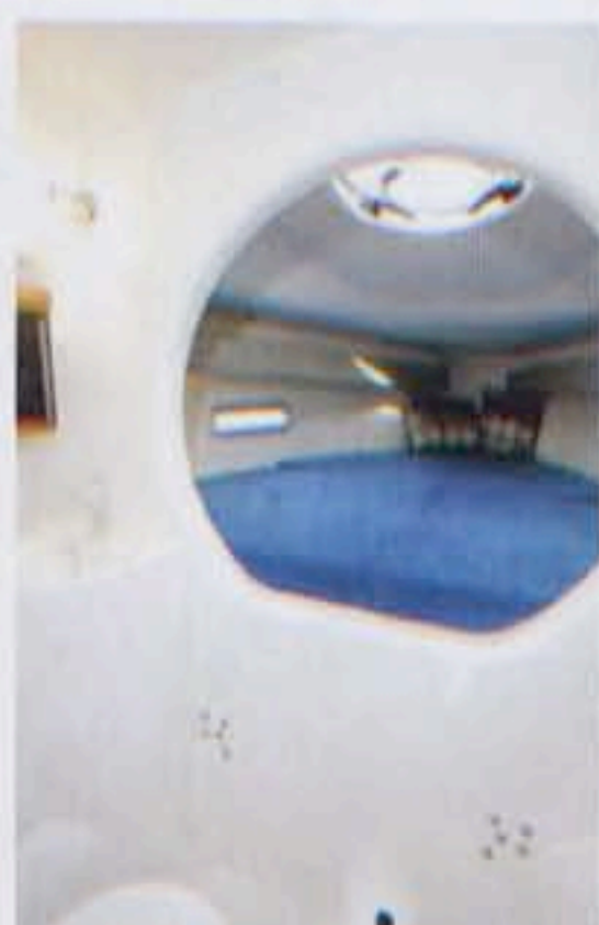
Basic forecabin through the structural bulkhead