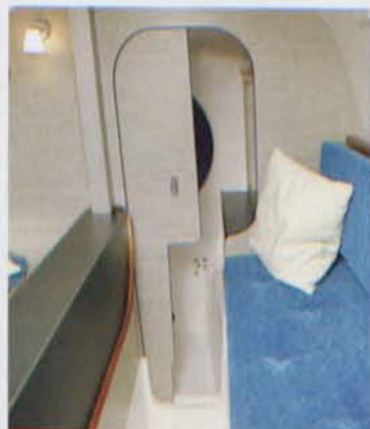
A space-saving sliding door separates the saloon and heads