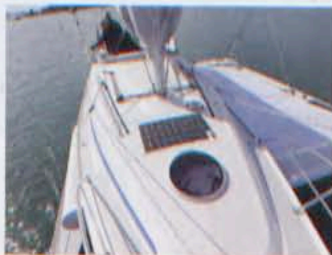
With floats hauled in, beam is reduced but length is increased